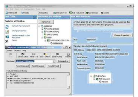
Establish instrument connection faster with Keysight IO Libraries Suite.