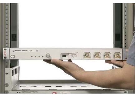
Make the most of your rack space with an Keysight 6000L Series oscilloscope.