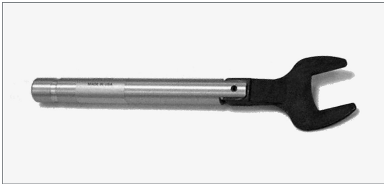
Keysight 20 mm torque wrench 8710-1764

The APC-3.5 (m) connector used on the SNS Series of noise sources has an extra-large nut to make it easier to tighten without applying torque to the noise source body. A 20 mm torque wrench is also available from Keysight for this application. Please contact your local Keysight representative for ordering information.